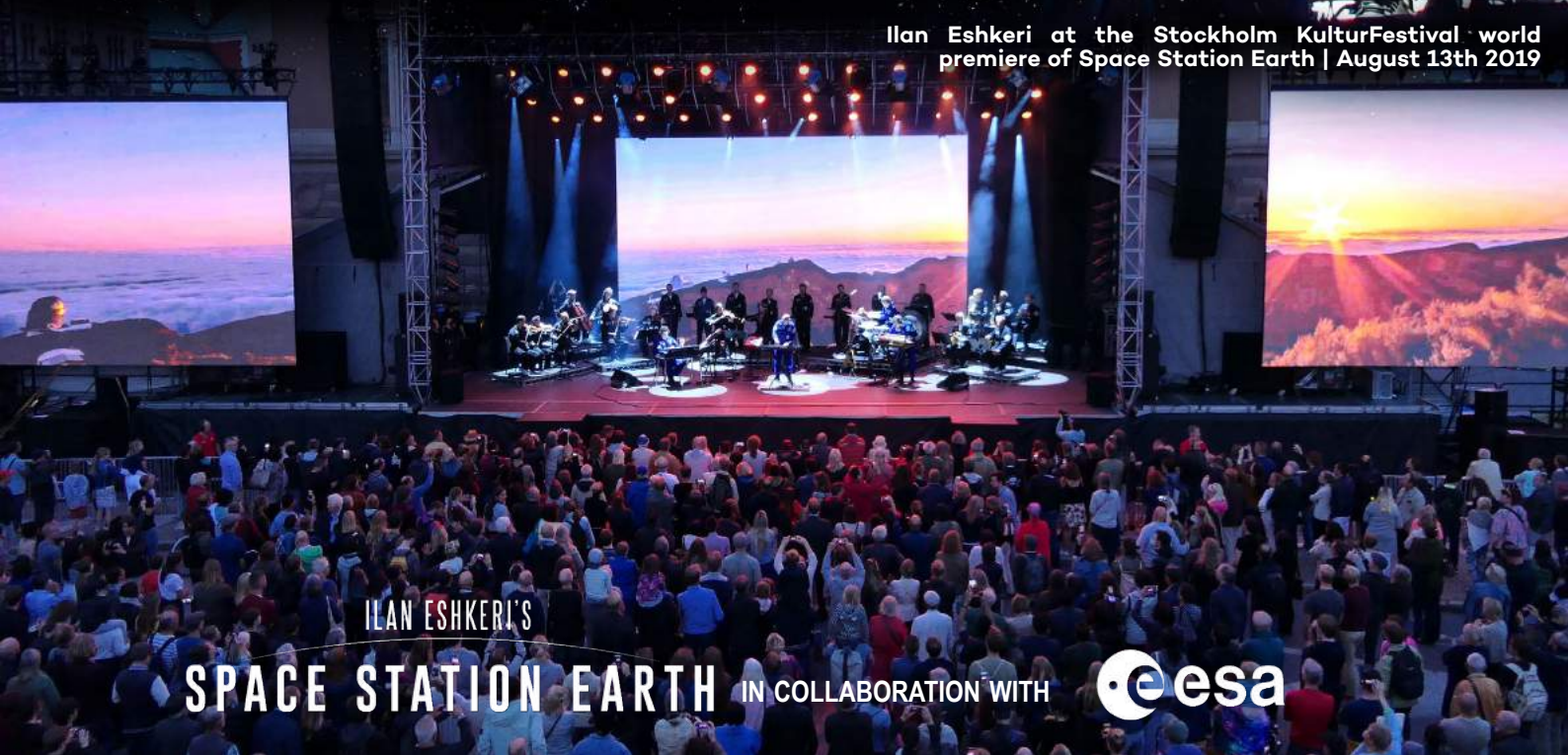
Ilan Eshkeri at the Stockholm KulturFestival world premiere of Space Station Earth | August 13th 2019

In the Spring/Summer of 2022, ESA will present Space Station Earth on a European tour featuring many of its astronauts who have actually been on space missions.